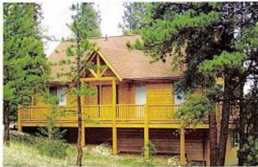
Big Timber Custom Homes